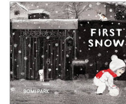
First Snow Bomi Park